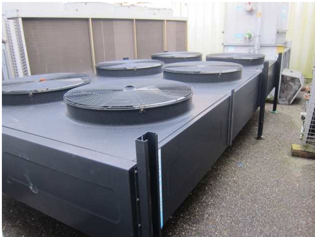
Cooling capacity [kW] (low speed)

Brand : Friga Bohn Type : ECA 223 P6 12P Year of build : 2001 Capacity : 111,8 kW * See Photo below Capacity fans : 0,5 kW RPM fans : 500 Number of fans : 6 Diameter Fans : 900 mm Sizes : 4500x2350x1080 mm (LxWxH) Weight : 925 kg.